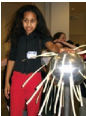
LEFT: Static electricity creates a bad hair day at Electrical Engineering.

A record 7500 students, teachers, and parents interacting with 100 hands-on exhibits detonated a high-energy explosion of fun and learning at the April 21–22 Engineering Open House. Saturday drew many families and alumni. For more details and photos, visit: http://www.engr.washington.edu/enews/2005-05/15.html/ .