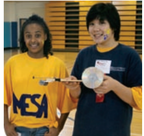
Scholarships could turn these students into UW graduates and engineers of the future.