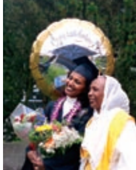
Civil & Environmental Engineering