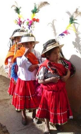
Girls in festival finery. Village life is rich in spirit, expressed in love of vibrant color.