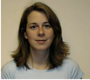
Kathleen Bean Landscape Architecture University of Stockholm Stockholm, Sweden